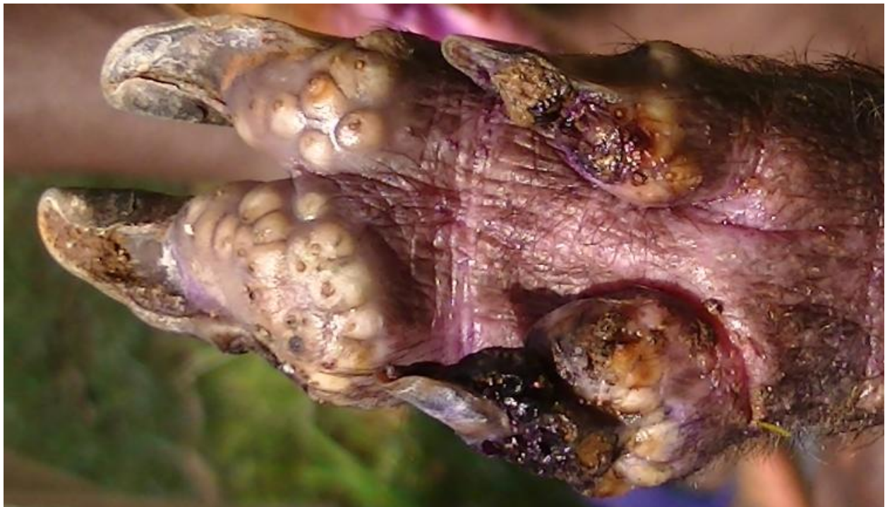
Fig: Clustering of tungiasis lesions on the coronary band and hoof bulb of the pig associated with extensive necrosis and hoof deformity